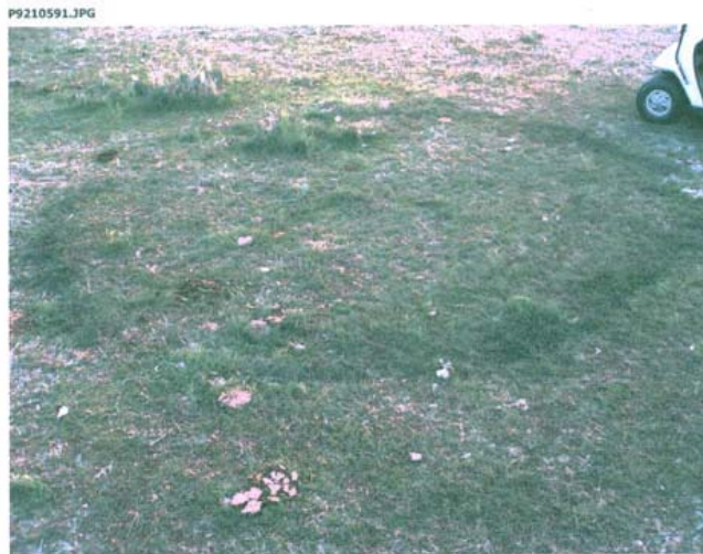
Image 1 of 1. < previous || next > Close Photograph of the circle

At approximately 3:00 a.m., October 2, 2008, the witness got up and noted that it was "real light" outside, but didn't look out. A black circle about 15 feet across in the direction of the bright light was noticed the morning after the event. The black residue around the circle was "kind of frosted" and glowed somewhat. A photograph of the circle follows. The objective is to examine the circle soil for any anomalies.